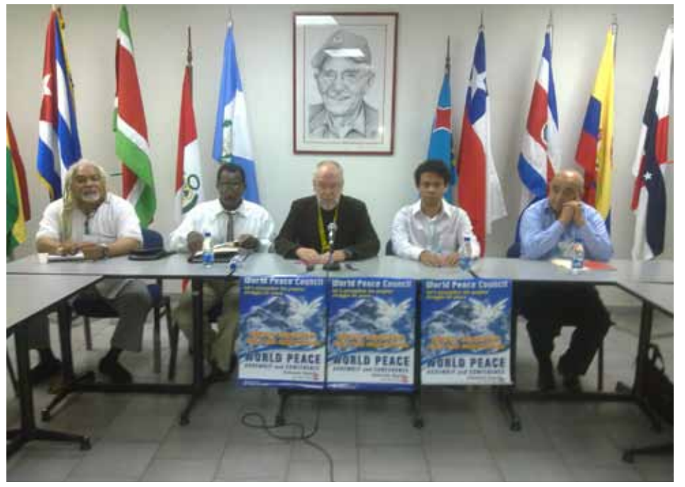
World Peace Council Press Conference, Caracas, Venezuela

"Members of the international community [meaning the U.S. and its allies] are left with the option only of having to