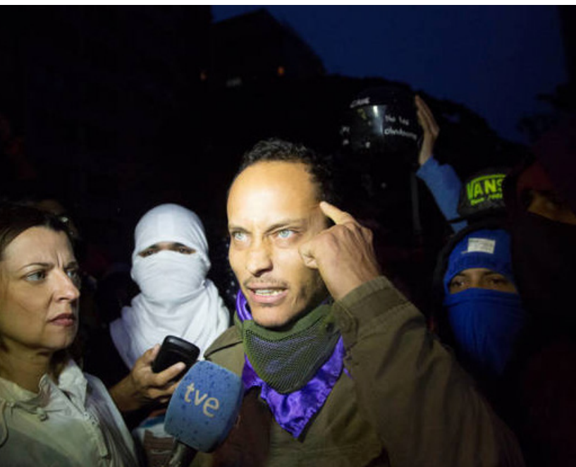
Oscar Pérez organized terrorist cells with which he succeeded in attacking Venezuelan State institutions.