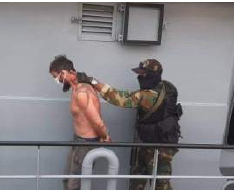
The captured mercenaries in Venezuela confessed that part of the plan set was the capture and assassination of Nicolás Maduro.

cluded a retainer of 50 million dollars to train and equip mercenaries, a retainer that the National Assembly Representative would have failed to pay. Goudreau provided Poleo with a video that he recorded as he talked with Guaidó over the telephone, establishing agreements and signing the contract.