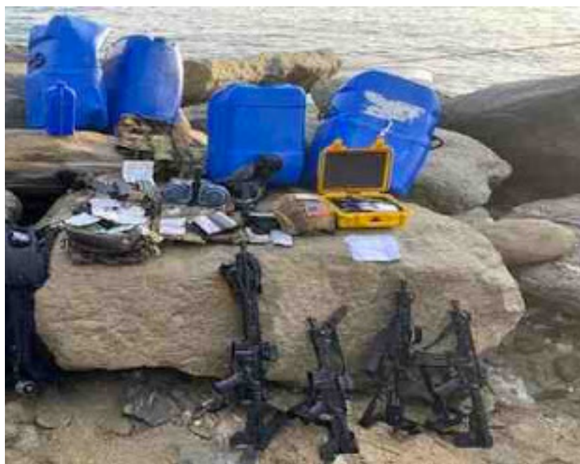
Part of the weapon cache seized from the group of mercenaries that tried to land at the locality of Macuto, in La Guaira state.

In the early hours of May 3, a mercenary incursion was frustrated off the coast of Macuto, in the state of La Guaira 27 . The Minister of the Interior, Justice and Peace of Venezuela, Néstor Reverol, reported that the FANB along with the Special Actions Forces (FAES, Spanish acronym) of the Bolivarian National Police (PNB, Spanish acronym) counteracted a maritime invasion attempted by non-state actors on the coast. The official name of the defence operation was "Operation Negro Primero " after a significant hero of the Independence war.