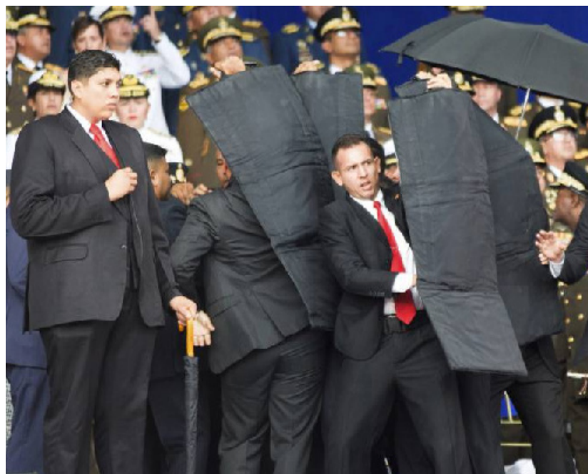
On August 4, 2018, Venezuelan terrorists trained in Colombia attempted an attack against President Nicolás Maduro and other senior officials.

“Spokespersons [of the U.S. president] Donald Trump’s administration are fabricating in this moment a narrative about an absurd amount of alleged defectors of our Bolivarian National Armed Force (FANB, Spanish acronym), for purposes of justifying the creation of an alleged Liberation Army of Venezuela in Colombian territory with the intention of penetrating our country and destroy the peace of our nation,” he argued.