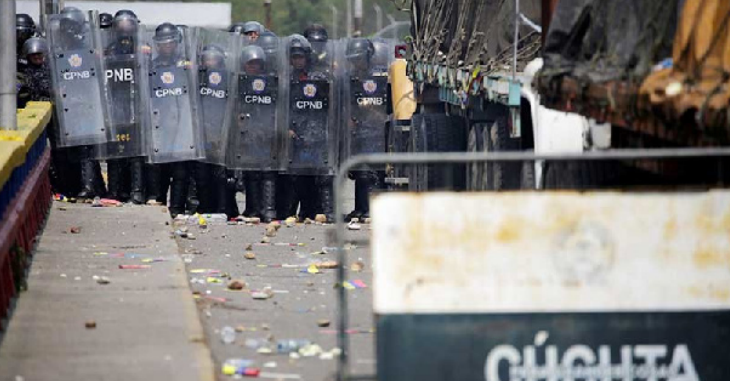
Venezuelan security forces block the Francisco de Paula Santander Bridge at the border crossing between Colombia and Venezuela. February 23, 2019.

Moncada stressed that such actions were not about the “public use of the military force but rather its clandestine use,” with mercenaries “in the same way as it was executed in Nicaragua in the cruel Contras war (in the 80’s)” to legitimise it as a salvation army.